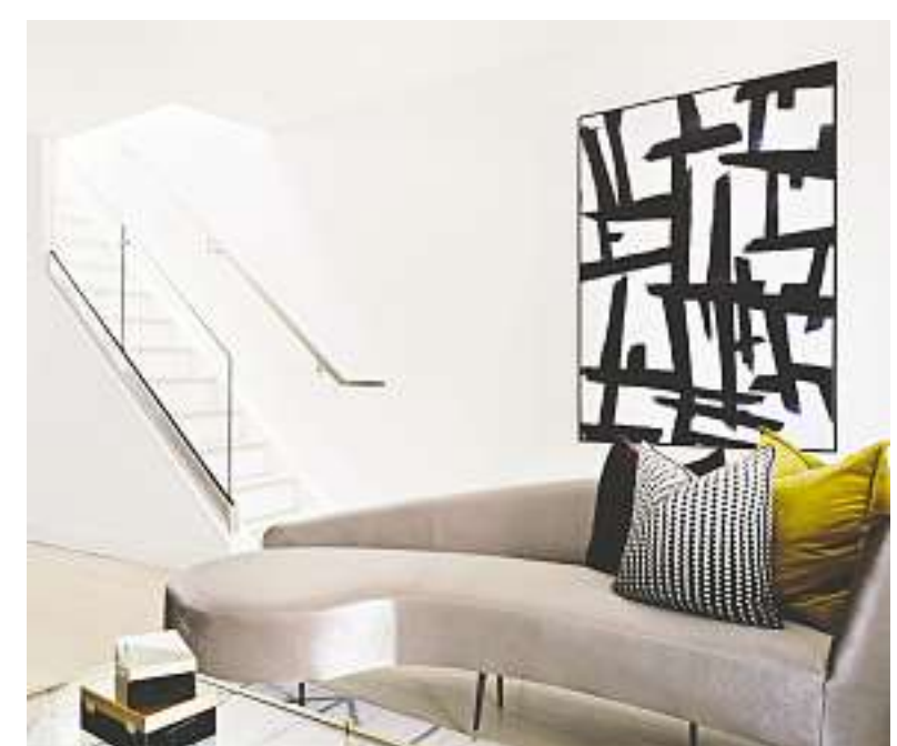
Consider the size and placement of your furniture in each room.

Home staging may be part of your real estate agent's services, but if not, consider investing in a professional, and when it comes to taking photos, don't rely on your smartphone. Barrineuvo recommends hiring a professional who can produce magazine-quality images that will allow prospective buyers to imagine themselves living there.