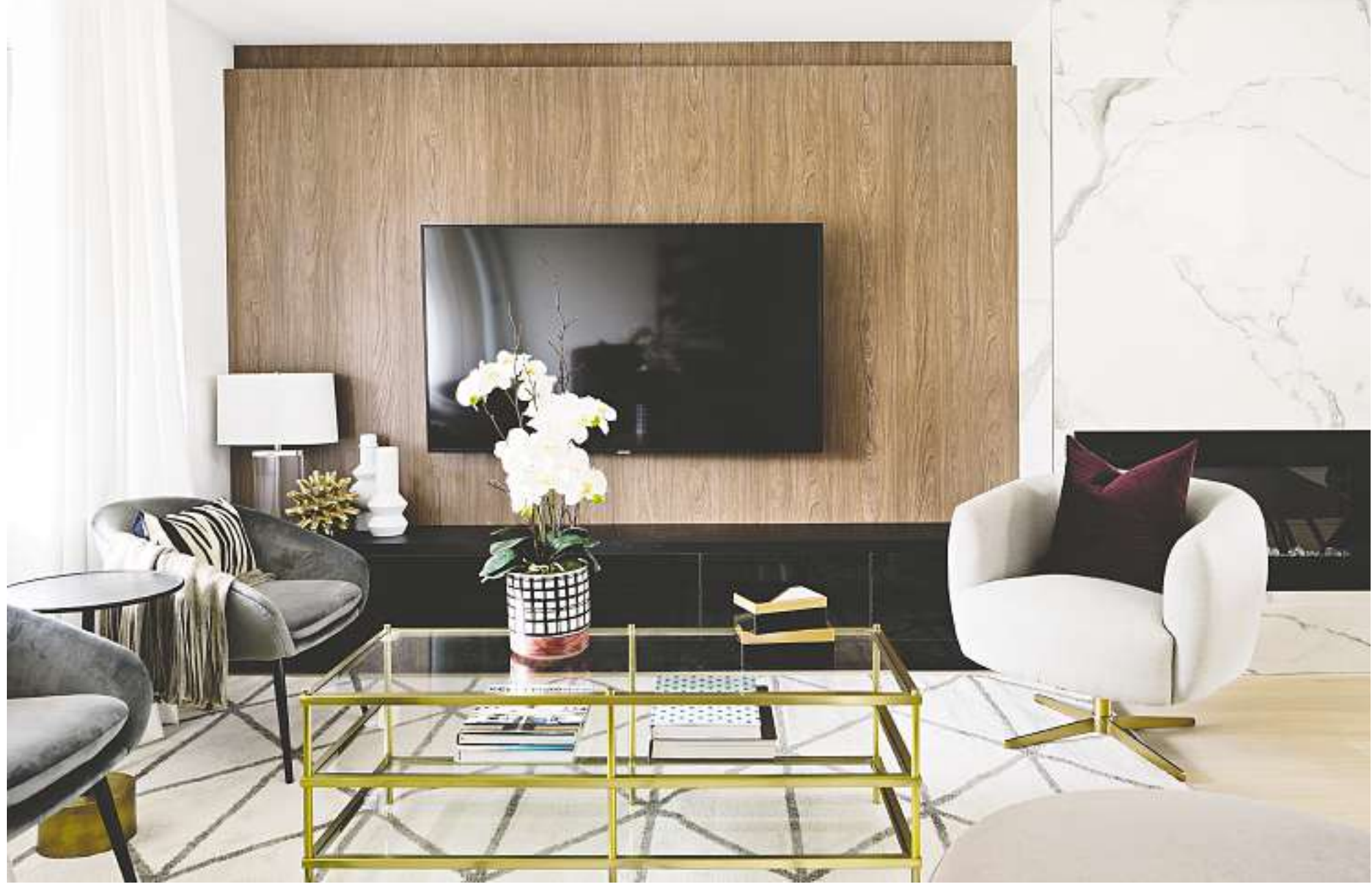
Designer Red Barrinuevo says when taking photos to sell your home, don't stage it to look like a showroom. Instead, create a comfortable vibe to give a lived-in yet organized impression.