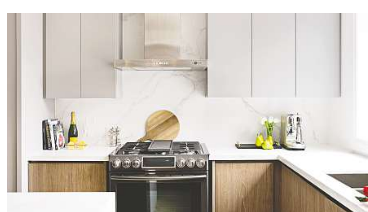
Have no more than two small appliances on the countertop, such as a blender and an espresso machine.