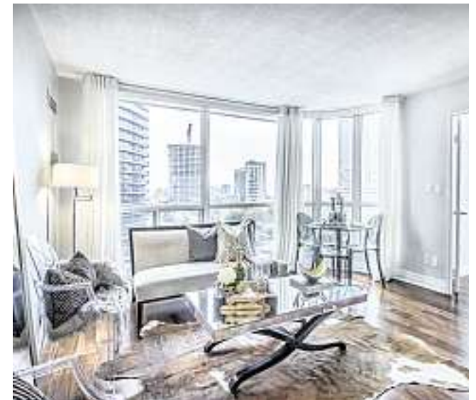
Consider adding ceramic table lamps that repeat colours in the upholstery, pillows, throws or window treatments.