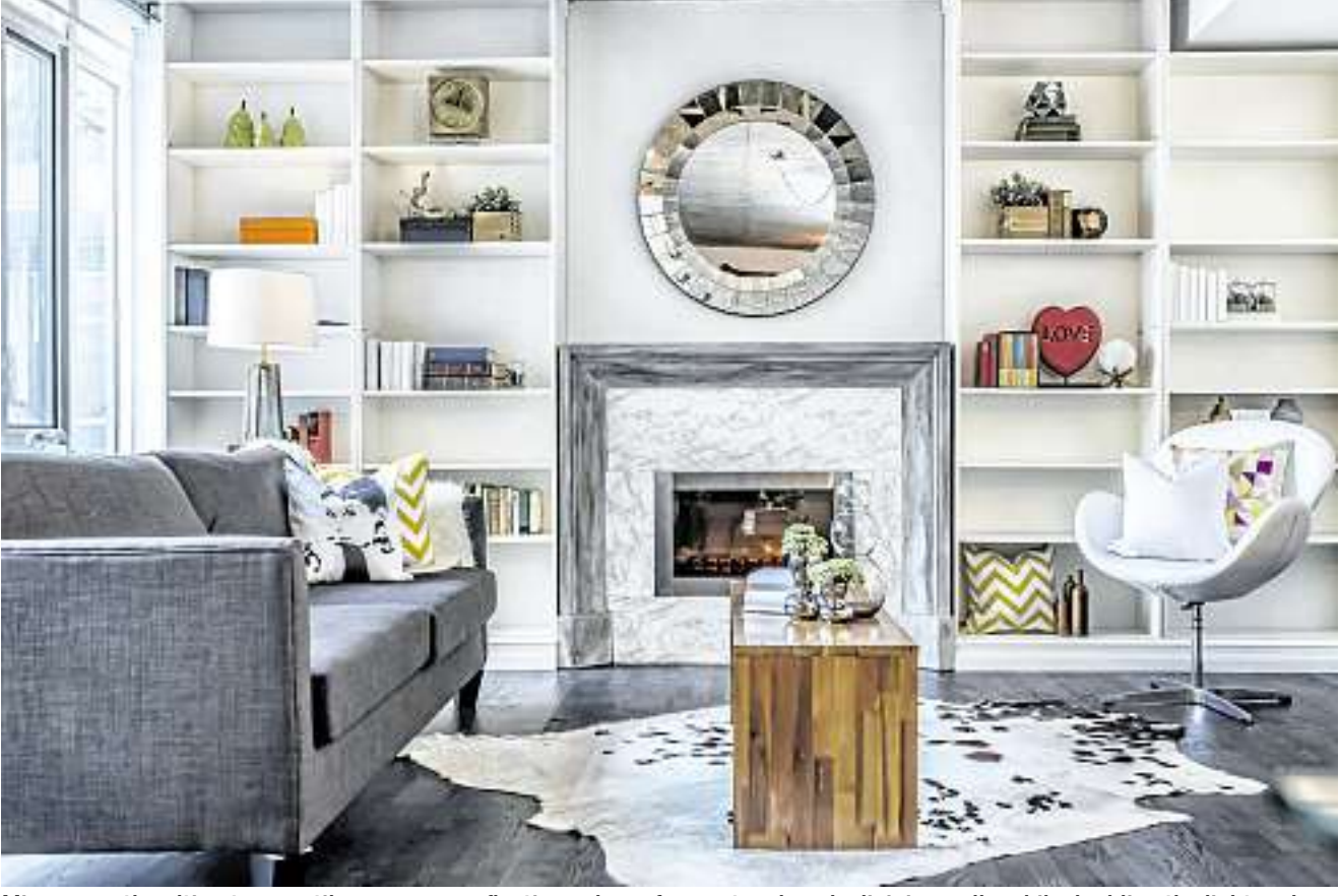
Mirrors are the ultimate versatile accessory reflecting colours from artwork and adjoining walls, while doubling the light and depth of a room.

Classic placement for paintings and photos includes suspended over a fireplace or above a piece of furniture that serves as a focal point. Consider also overlapping a few canvases on a mantel, or leaning up against a wall.