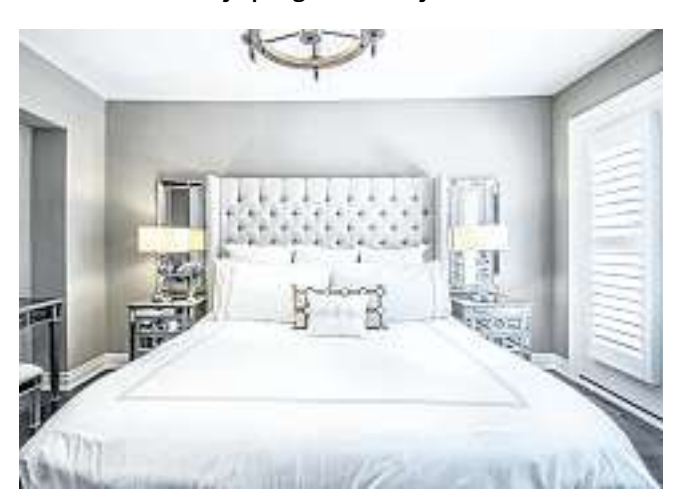
Pillows are the perfect, inexpensive way to indulge in the colour du jour without the commitment.