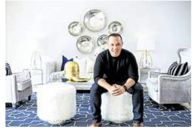
Staging a home can increase its value, attract buyers and help it stand out in a busy spring market, says Red Barrineuvo.

Replace the shades of some of your lamps to introduce a different texture, add colour or coordinating pattern.